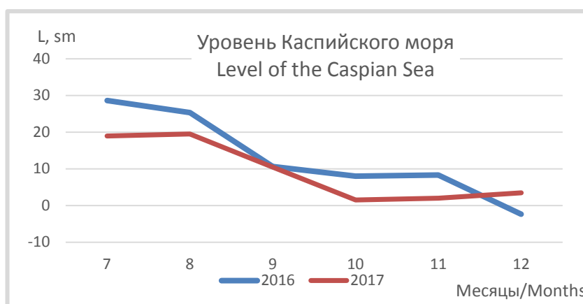
Fig. 1 Seasonal run of the Caspian Sea level in the second half of 2017 as compared to 2016

The mean Caspian Sea level at the seasonal peak in July 2017 occurred 10 cm lower than in the previous year. However, the rate of its seasonal fall was also less than in the same period of the previous year. As a result, the mean sea level in December 2017 went few cm higher than in December 2016 (Fig. 1).